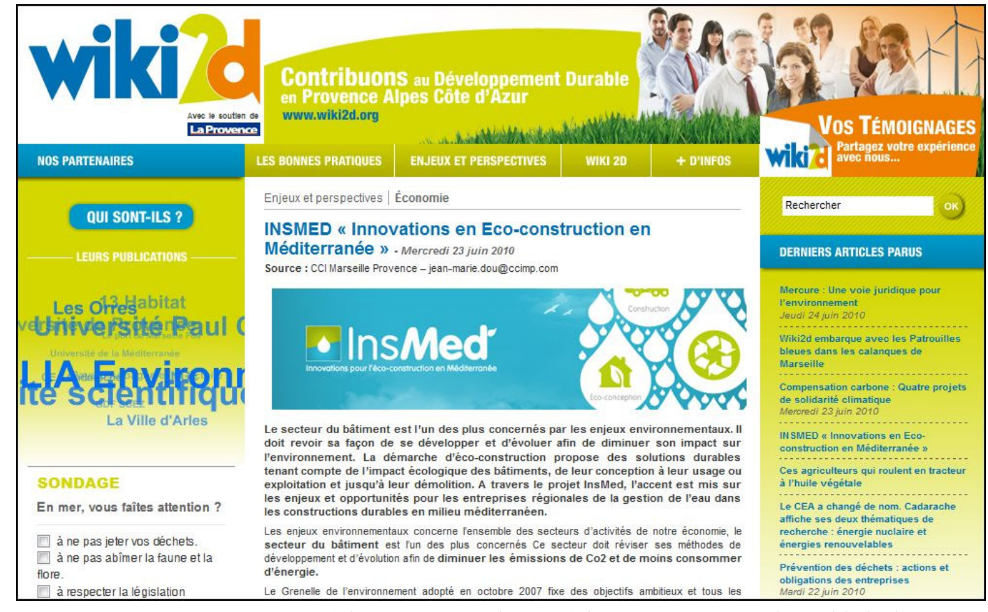
Figure 1 Main screen of the WIKI2D, with one of the most recent articles published

The following figure shows the main framework of the screen of WIKI2D, with in the centre one of the article recently published.